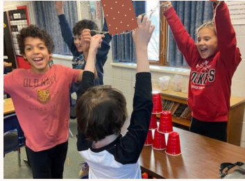
4th grade students celebrating when they completed their cooperation and problem solving activity!