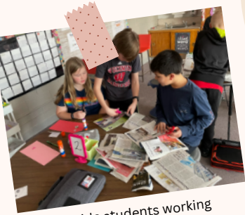
Bayside students working hard on their Growth Mindset Newspaper Activity!