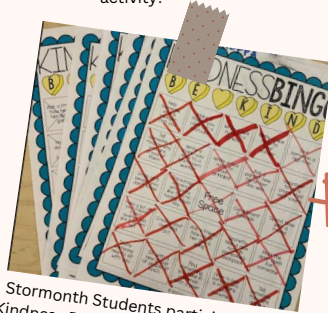
Stormonth Students participated in Kindness Bingo leading up to Random Acts of Kindness day on February 17th!