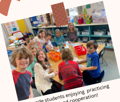
1st grade students enjoying practicing teamwork and cooperation!